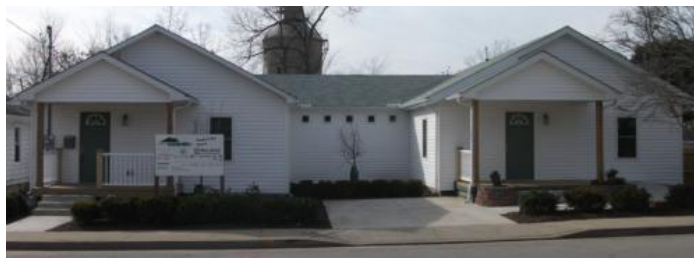
The Legacy Home --- Lexington is located at 938 Delaware Ave.

The Legacy Home is taking applications for residents. It is owned and operated by Lexington Cooperative Ministry Inc., a non-profit corporation. The Home is designed for five women 55 years and older who have modest incomes so they may share rent and other expenses to minimize the cost of growing older. It is an opportunity to stay in community and it is a wonderful new alternative to large apartment buildings or living alone.